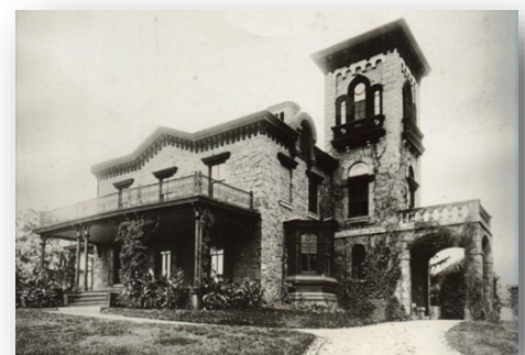
Tilton Mansion 805 N. Broom St.