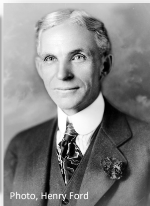
Photo, Henry Ford